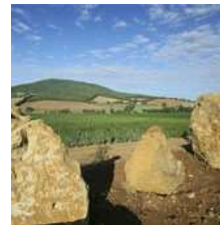
Panorama of the estate and the Rocks extracted during the deep drainages of the land